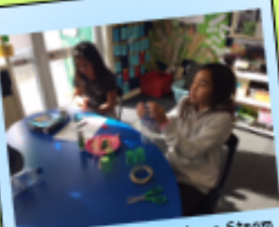
Engaged learners during a Steam Challenge