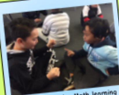
Team work during Math learning