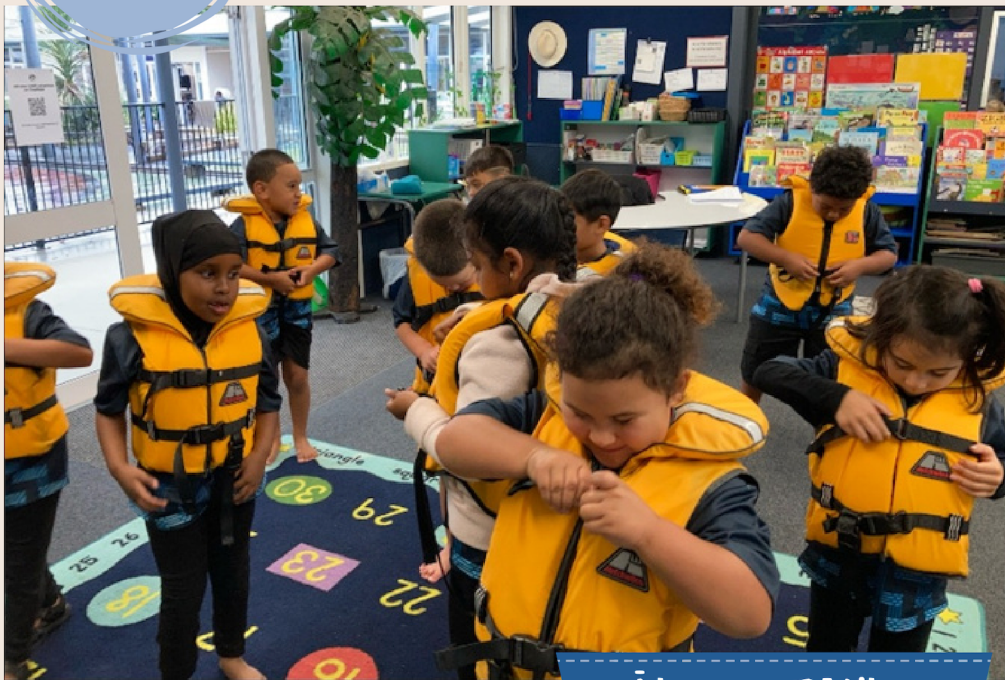
Ākonga Tūtika A Responsible Learner