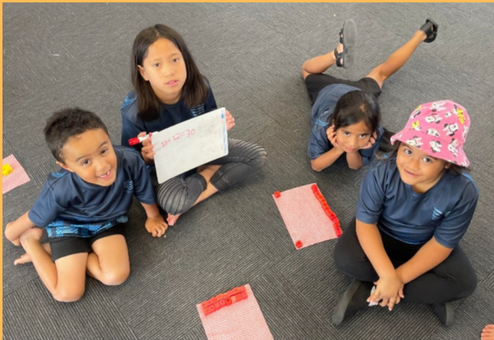
Karawhina! Give it heaps!